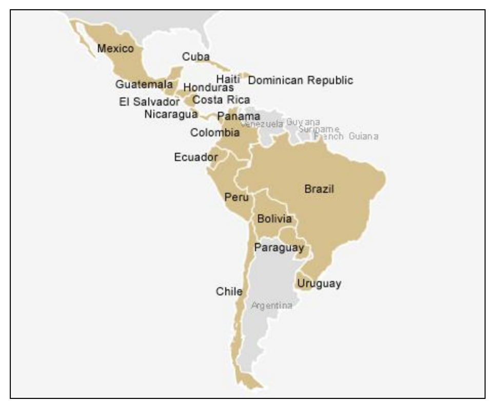
Latin American countries with active Joint Programmes as part of the MDG-F thematic window on Democratic Economic Governance

Out of the 11 countries that are part of the DEG thematic window, seven are located in Latin America, two in Europe, one in Asia and one in Africa: